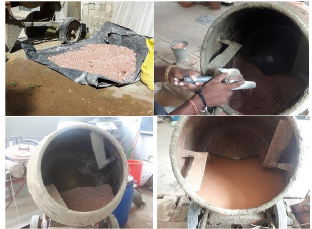
Figure 3 Use of Concrete Mixer for Soil Washing

Earthen materials have been used by global Civil Engineering constructions in different forms, such as mud, adobe, rammed earth, soil blocks, bricks, roof tiles, etc. Soil with a lower clay percentage is ideal for making soil blocks. Clay is used primarily in the manufacture of bricks and roof tiles. Because raw materials for the production of bricks and roof tiles are scarce, several alternatives for walling materials have been investigated. Clay extraction from clayey soil via washing may be a viable option for obtaining adequate materials for the construction of soil blocks, bricks, and roof tiles. If clay can be removed from soil that has high clay content, that soil would be preferred for Compressed Stabilized Earth Blocks (CSEB) production. Extracted clay can be used for bricks and roof tiles production with some modifications such as adding fly ash and rice husk ash. The whole idea of the study can be illustrated in Figure 1.