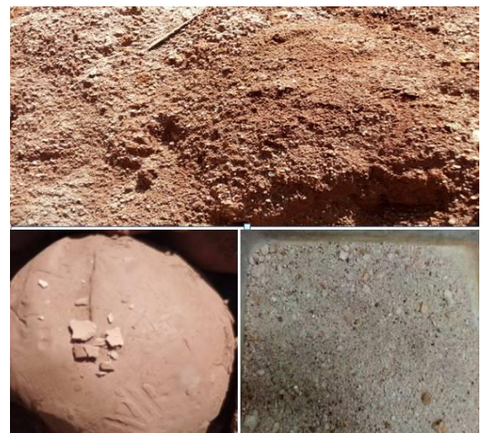
Figure 4 Used soil, Separated Finer and Gravel