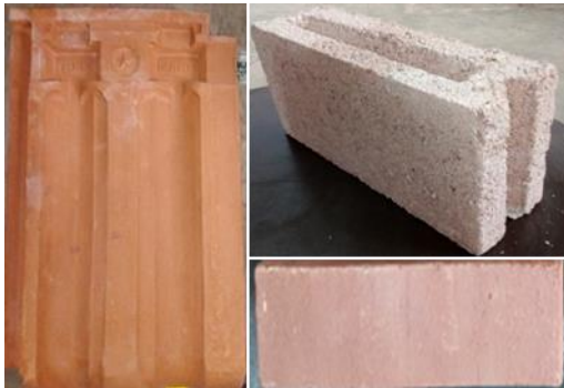
Figure 5 Innovative soil-based products

Performance of burnt clay bricks and roof tiles made with extracted clay by adding 25% of fly ash by weight are met with the relevant Sri Lankan standard SLS 39: Specification for Common Burnt Clay Building Bricks and SLS 2: Specification for Clay Roofing Tiles . Figure 4 shows these three soil-based building materials.