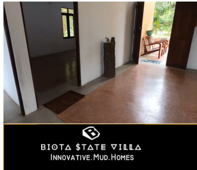
Figure 3: Finished floor in mud house

This novel in-situ cast technology having series of advantages to the construction industry such as minimum energy consumption and lesser waste generation. In this technology, any type of soil could be improved up to the proposed proportions and easily make it for construction. Due to the self-compacting quality of the mix, there's no need any compaction/ramming or vibration; mix will self-compact; just need to pour the mix into well prepared ground and floor is obtained the strength with mix properties and curing condition. Gravel particles will remain as it is in the mix that will help provide much architectural appearance to the finished floor. The novel technology will cater to the current demand for easy and quick construction technologies. This system is capable to cater for the different architectural requirement, maintaining its quality and user comfortability specially in tropical climatic condition like Sri Lanka.