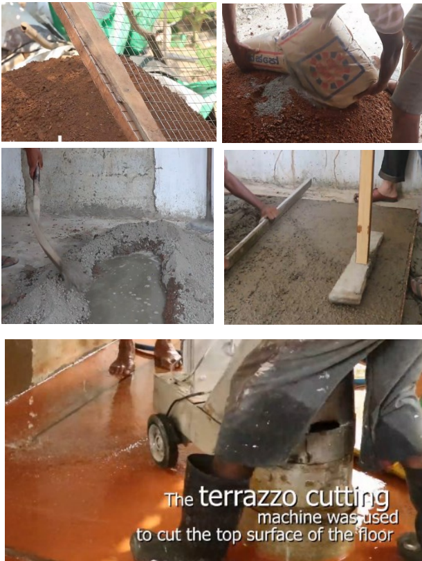
Figure 2: Few steps of floor casting

The top surface of the soil concrete floor should have a better architectural appearance and smooth enough for user comfort. Therefore, after 28 days from the casting the floor is to be smoothen by using a terrazzo cutting machine. Then the clay cement plaster to be applied in two layers. Then, the top wash coat which are available in the current market is applied same as cement rendering floor, terrazzo floor and parquet floor.