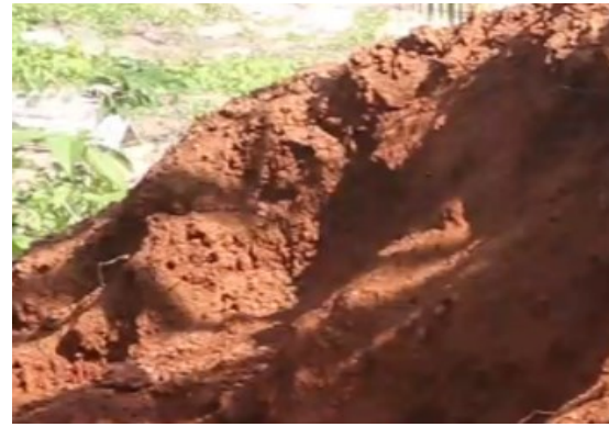
Figure 1: Soil use for flooring system

Soil-concrete flooring system is a sustainable, novel earth-based flooring system which was inovated in University of Moratuwa as a result of series of experiment works. This innovation was recently come out as a effort of prof. R.U.Halwatura and his assistant. The concept of soil flooring is to develop a composite material out of soil as a flor base and finished with floor coating. This system is slightly similar to conventional terrazzo flooring; this is more sustainable than that. The more important factor is the soil required for the floor casting can be taken from the gravel pit closer to the site. The selected soil should be subjected to sieve analysis and can be developed to required soil compositions. Admixture, cement, and water to be added according to the correct mix design. The laying of soil concrete on the floor is a fully manual process. The ground that used to lay the floor has to thoroughly compacted and moist before laying. The 75 mm thick soil concrete floor base and a floor sealer, which is currently used in cut cement floors, as the top surface coating was recommended.