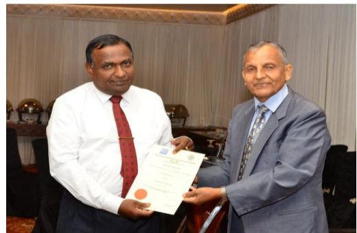
New Company Registration