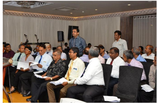
Appointment of New Council Members