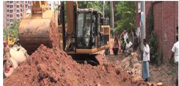
Conventional building construction

worse. In this article, while highlighting the above environment challenges and how these challenges could be addressed through the green building concept.