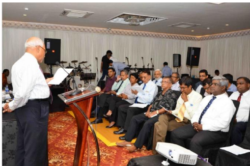
Hon. Secretary's Speech